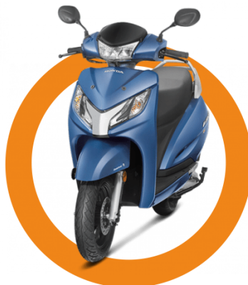
2 nd PRIZE Honda Activa 125cc