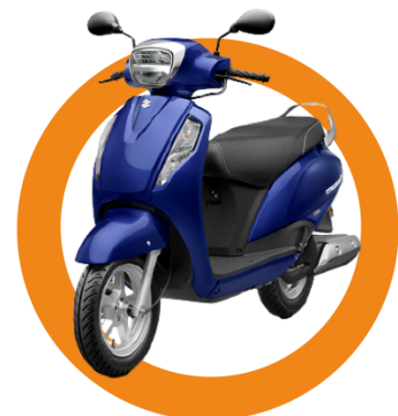
3 rd PRIZE Suzuki Access 125cc