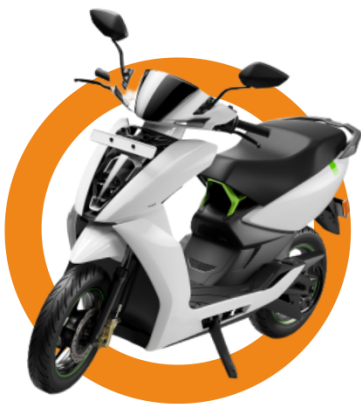
1 st PRIZE Ather 450x