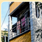
KC (BOYS HOSTEL)