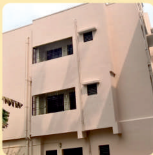
LS (GIRLS HOSTEL)