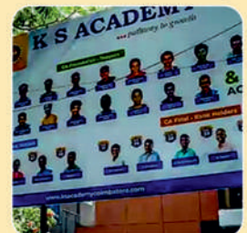
RAMNAGAR (BOYS HOSTEL)