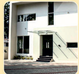
SAI VILLA (GIRLS HOSTEL)