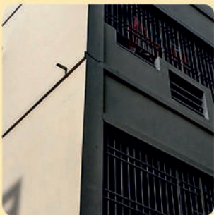
RR (GIRLS HOSTEL)