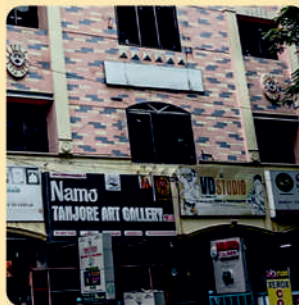
PRJ (GIRLS HOSTEL)