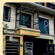
SAI BABA (BOYS HOSTEL)